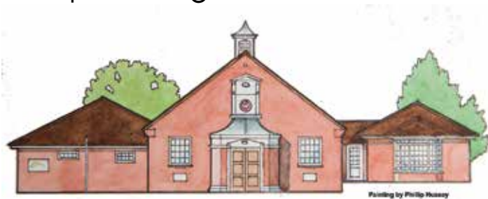
Reg Charity: 300309